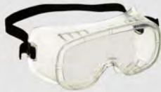
EYE SAFETY GOGGLES