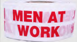
BARRICADING TAPE 300 & 500 MTS