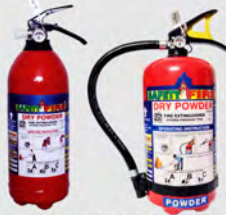
ABC POWDER TYPE 1KG, 2KG & 4KG