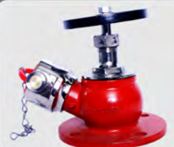
HYDRANT VALVE (SS & GM) OMEX & ARIHANT