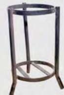
FLOOR STAND (ABC & CO2)