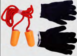
EAR PLUGS AND COTTON GLOVES