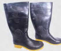
GUM BOOTS HEAVY