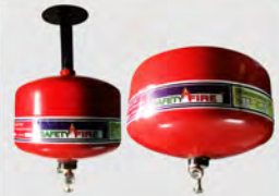
AUTOMATIC MODULAR 5KG & 10KG