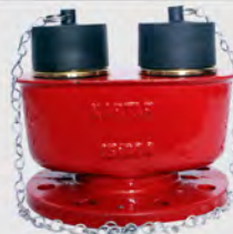
FIRE BRIGADE TWO WAY & FOUR WAY