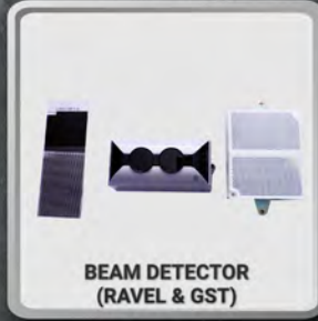
BEAM DETECTOR (RAVEL & GST)