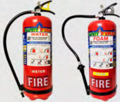
WATER 9KG & FOAM 9KG