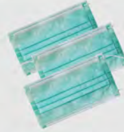
SURGICAL MASKS 2PLY & 3PLY