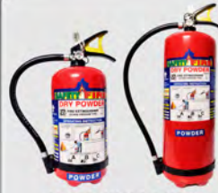
ABC POWDER TYPE 6KG & 9KG