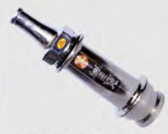
BRANCH PIPE (SS & GM) NEW AGE, ARIHANT & OMEX