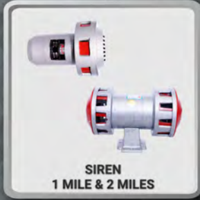
SIREN 1 MILE & 2 MILES