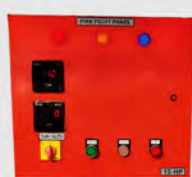
AUTO Matic FIRE HYDRANT PANEL (L&T)