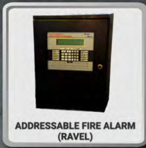
ADDRESSABLE FIRE ALARM (RAVEL)