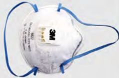
CHEMICAL MASKS 3M - 8822