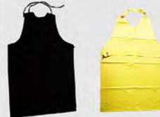
APRONS COTTON & PVC