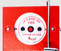
MANUAL CALL POINT AGNI