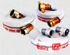
RHL HOSE (SS & GM) NEW AGE, ARIHANT & OMEX