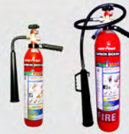
CO2 2KG & 4.5KG