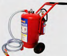
DCP TROLLEY TYPE 50KG & 75KG