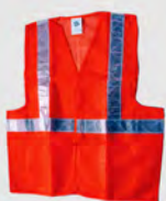
REFLECTING JACKET (ORANGE 1" & 2")