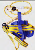
SAFETY BELT HALF & FULL BODY