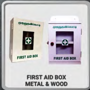
FIRST AID BOX METAL & WOOD