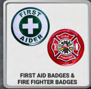
FIRST AID BADGES & FIRE FIGHTER BADGES