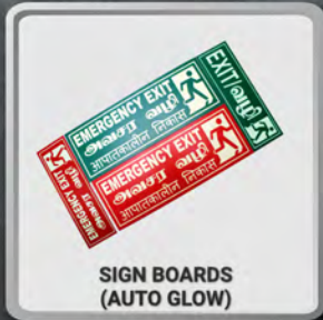
SIGN BOARDS (AUTO GLOW)