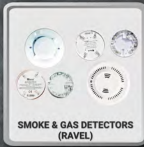
SMOKE & GAS DETECTORS (RAVEL)