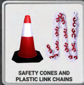
SAFETY CONES AND PLASTIC LINK CHAINS