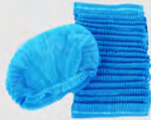
HEAD CAPS 2PLY