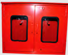
HOSE BOX DOUBLE DOOR