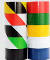
INDUSTRIAL FLOOR MARKING TAPE