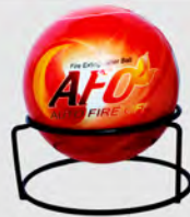
FIRE EXTINGUISHER BALL 1.3 KG