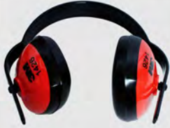
EAR MUFFERS 3M