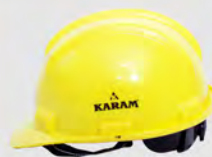
SAFETY HELMET (KARAM RED, WHITE AND YELLOW)