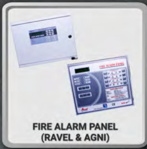
FIRE ALARM PANEL (RAVEL & AGNI)