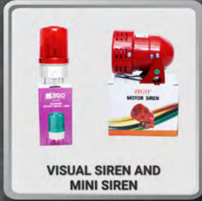
VISUAL SIREN AND MINI SIREN