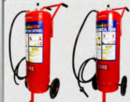
WATER 50KG & FOAM 50KG TROLLEY TYPE