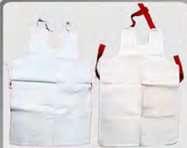
BOILER APRONS LEATHER & ASBESTOS