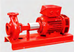
KIRLOSKAR FIRE PUMP 5HP, 10HP & 15HP