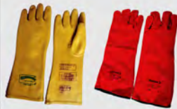
EB GLOVES (33KV) AND WELDER GLOVES