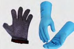
METAL GLOVES AND CHEMICAL GLOVES