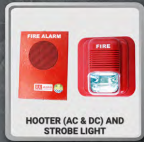
HOOTER (AC & DC) AND STROBE LIGHT