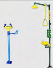
EYE WASH BASIN (HALF & FULL SET)